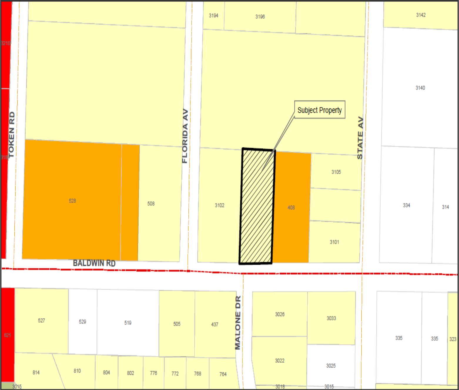
Exhibit A Zoning Change City of Panama City